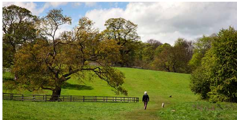
A fine day in Jacob Smith Park

At a recent meeting of the Friends of Jacob Smith Park a representative from Harrogate Borough Council stated that cutting pedestrian entrances in the park wall was permitted development and did not require planning permission, no further consultations were required and that the work would be completed imminently in the interests of public safety. This was questioned by many attending the meeting as permission had previously been applied for. As no work has been undertaken as yet, SPC await a further application or information from HBC.