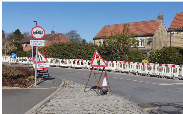
Excavation works along Greengate Lane for installation of fibre optic cabling

Full Fibre network has been made available to all households in Scriven Parish as a result of the installation of underground cabling and overhead “daisy chain” links from telegraph pole to telegraph pole. At the moment residents are able to buy into either Talk Talk or Boundless with additional providers due to become available shortly.