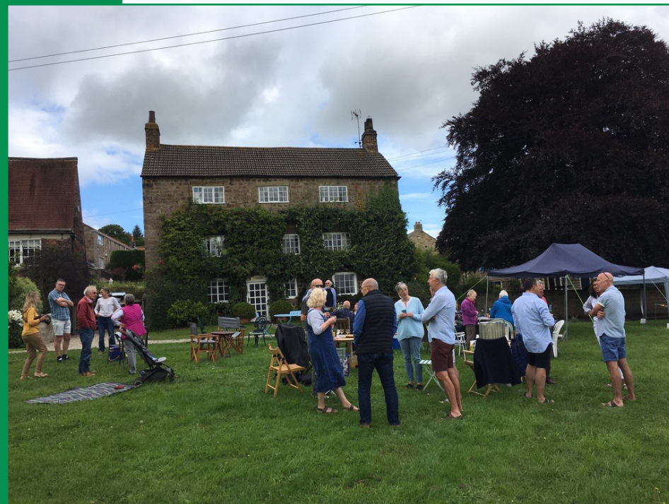
Summer Picnic on the Village Green